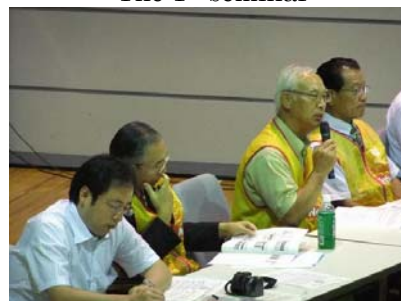
The 2 nd seminar