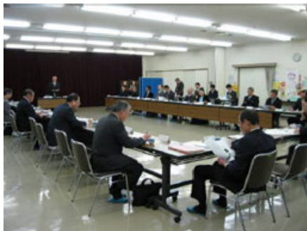
Towada Safe Community Promoting Association

Introducing each organizations, Towada Safe Community Association was organized by representatives of the related field, such as a public health, a welfare, a education, a crime prevention, a disaster prevention, a government so on. The president of the association is Mayor of Towada City. This association decides on their policy and makes various programs promote in collaboration with the related organizations and residents.