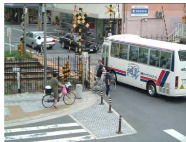
Example of Improvement of Dangerous Place. Sidewalk was built on a rail closing