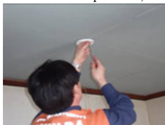
Spreading a fire alarm