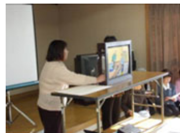
Story told with picture about depression prevention by volunteer group