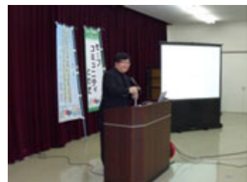
SC slogan contest