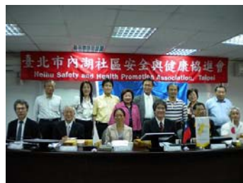
Neihu district in Taipei City

administrative office. For the visitors from Japan, members of Safe Community project kindly gathered and introduced their activities.