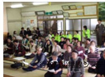
Guidance of fall prevention inside house