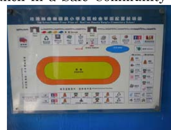
Safe School Guide Map