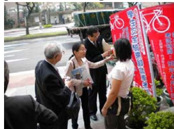
Banner for public relation of bicycle license

At the end of the trip, the group visited to one of the most active ISC in Taiwan, Neihu district in Taipei City. It has been actively improving community safety since its designation as ISC in 2005. They have set up the steering committee as non profit organization and a business person is taking the role of the president. The office is located close to the Mayor’s Office in the district