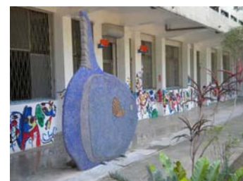
Setting up environment for prevention of slip on water