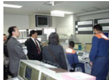
Radio Network System for natural disaster prevention

At the meeting after site-visit for 2 days, Towada was thought highly of their activities as well as Safe Community, and gotten advice that it is important injury surveillance, evaluation, putting full-time staff in position, to continue activities.