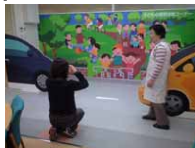
Simulated experience of Child view

After that we were showed inside center by nurse. In simulated experience of child view, we were surprised at child small view. And then we were guide to “Safe House”, it is very easy to see where child often get injury in the house, because real scene of injury is reproduce. We could find