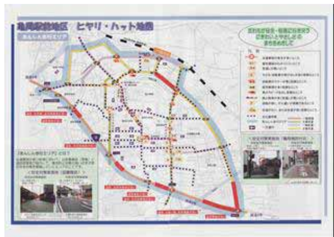
Map shows spots where residents feel unsafe

Nantan Civil engineering division designed the improvement of this road based on the result of experimentation and the questionnaire survey. And then the improvement of road has been started to in 2007. The improvement will be finished in June, 2009