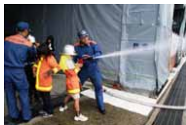
Phot-4 Training Course

At third workshop, this is the first participate of children in community, residents present children the result of two times workshop, and share their experience about disaster in their life. It is very important and valuable experience for kids to know a threat of disaster. Three times work shop put this program on a firm basis. (Phot-3)