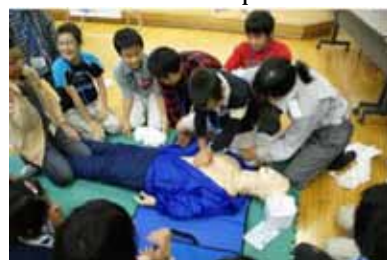
Phot-3 Training Course