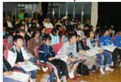
Phot-2 Work Shop for both