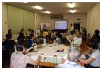
Phot-1 Work Shop for Adult

When you would like to get further information about this program, contact me!