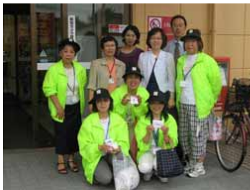
Campaign by volunteer group

A strong point of Towada is that volunteer group takes a leading part of the project for safety promotion in cooperation with City Government. Participation and support of them are surely leading movements for safety promotion. The people of Towada City expect that such movment will spread into whole city and become the member of international safe community.