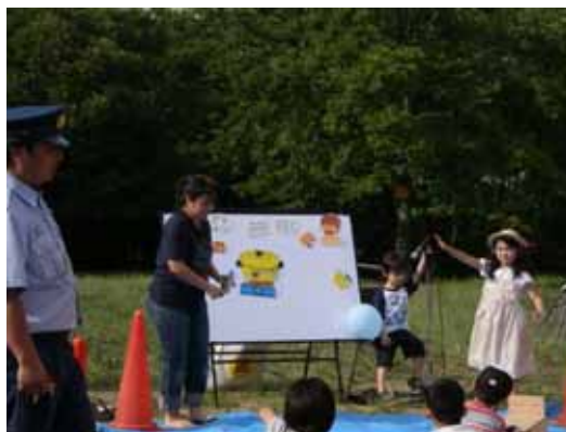
A puppet show

In Kangawa Prefecture, Atsugi city has been conducting activities for safety promotion, in order to become the member of Safe Community. Although Yokohama City has started activities for safe community, it was a grass-movement. However activities by member of training course are steady spreading into people in Yokohama.