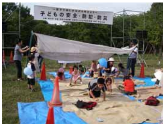
Curtain as smoke