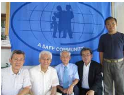
Shino-cho neighborhood Self-government association