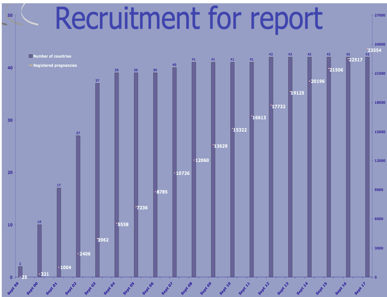
Fig 1. Number of Participating Countries and Pregnancies Reported to the Central Registry by September, 2017.

EURAP was implemented in the first two countries in Europe in 1999 and has since then grown to include countries from Europe, Oceania, Asia, Latin America and Africa. This development is reflected by increasing numbers of enrolled pregnancies. The development since 1999 is illustrated in Fig. 1.