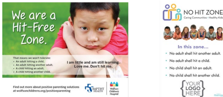
Figure 2. Available Toolkit Samples of NHZ Elements.