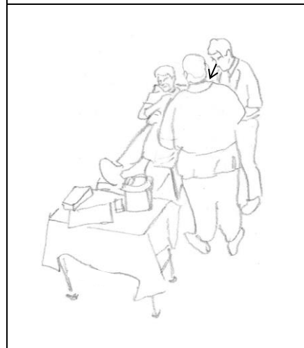
Figure 3-2: Joint attention on the tray