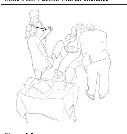
Figure 5-2: Joint attention on the morphine

In Extract 3, Mike's verbal action (mentioning his not knowing the dose) led Helen's nonverbal action, looking at the bottle, then eventually confirming the dose. In this case, an HCP's verbal action prompted the other HCP's nonverbal response.