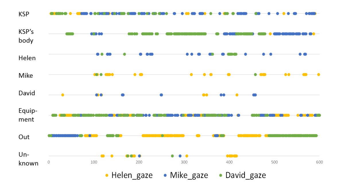
Figure 2: Objects and time of HCPs' gazes on timeline

Equipment). David, on the other hand, was engaged in medical procedures, i.e. blood pressure measurement and cannulation, gazing mostly at KSP's arm (3 mins 9 secs at KSP's body and another 3 mins at Equipment). Helen spent more than four minutes out of the camera to find equipment/medicines (Out, 4 mins 22 secs).