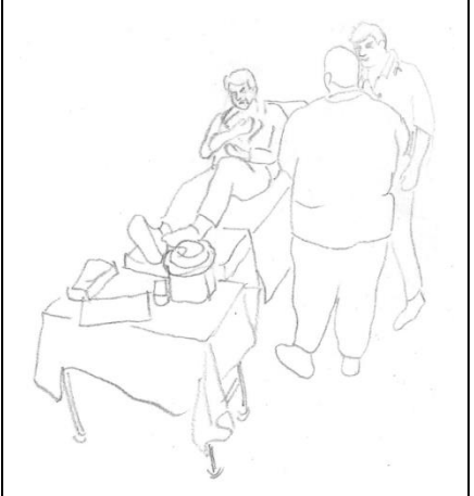
Figure 3-3: Mutual gaze (David and Mike)

The second example in Excerpt 2 is joint attention after Helen's gazing at an object, a