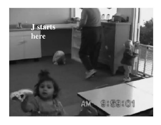
Figure 1: J's show action (Kidwell & Zimmerman 2007, p. 596)

shoe' although the body movements of the camera person were not captured in the video framework. J nodded and smiled, and then left the camera person.