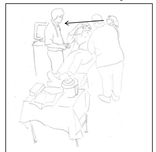
Figure 4-1: Helen's show action by gaze