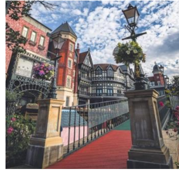
Shiroi Koibito Park