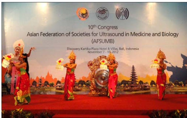
Gorgeous inauguration of 10 th AFSUMB Congress in Bali in 2012

Every 2 years, AFSUMB organizes Congress at one of its Affiliated Societies. Previously the congress was held at every three years. Last time in 2012, Indonesian Society of Ultrasound in Medicine has organized 10 AFSUMB Congress at Bali, Indonesia. The congress was well organized and participated from all AFSUMB Affiliated Societies and other countries.