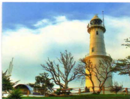
Selangor – Through the Countryside