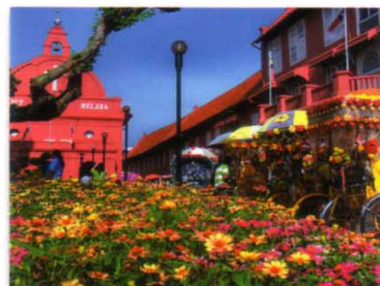
Melaka Heritage Trails