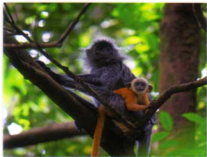
Kuala Lumpur City Nature Tour