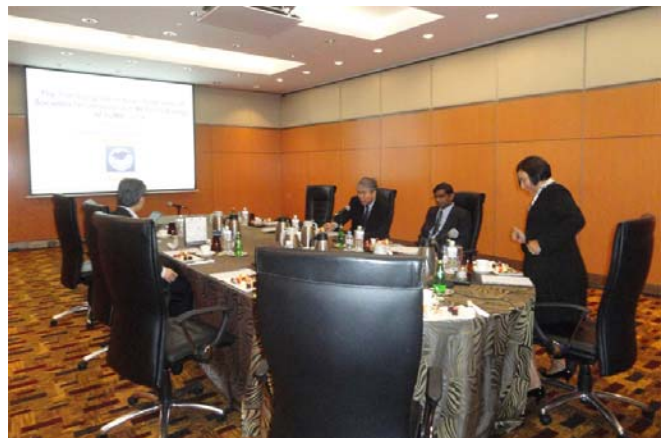
A discussion meeting

After inspecting all the facilities the Inspection Team expressed its deep satisfactions regarding the congress venue. Thereafter a discussion meeting was held. The organizing committee would like to request all affiliated organizations to promote and ensure good participation from their organizations.