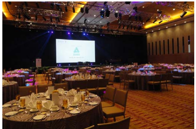
The banquet hall is huge and gorgeous