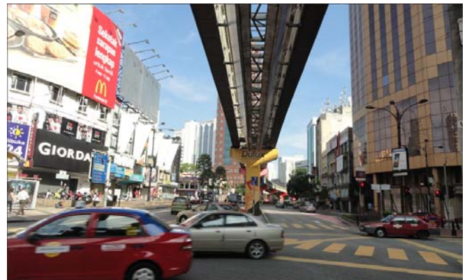
One of the very busy streets of Kuala Lumpur

Kuala Lumpur is the capital and most populous city of Malaysia. The city has hosted many international sporting, political, cultural and scientific events.