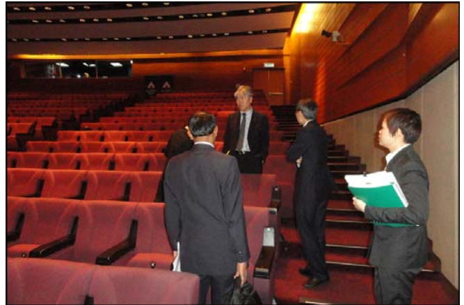
Auditorium can accommodated 500 persons

Kuala Lumpur Convention Centre is located at the heart of the Kuala Lumpur City Centre and 10 minutes walking distance from the famous Patronous Twin Tower. Level 3 of this convention centre is the site for the 11 AFSUMB Congress. Participants can see the Twin Tower through the windows of the conference venue. The Convention Centre is designed as a city within city with all facilities for any conference.