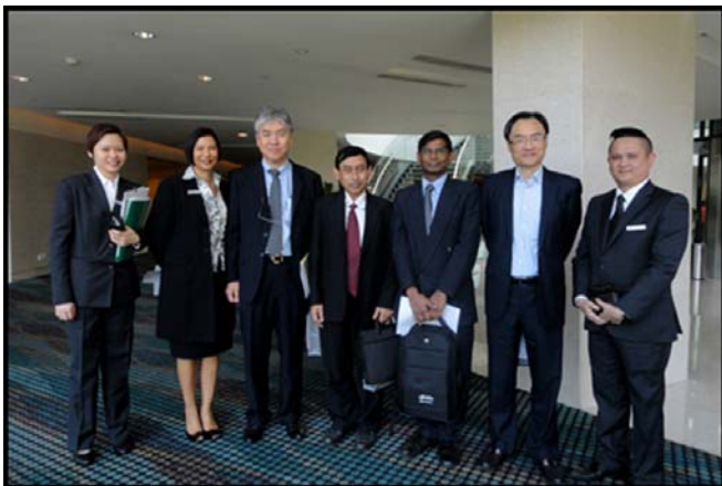
AFSUMB inspection team along with the executives of the convention centre

Kuala Lumpur Convention Centre is located at the heart of the Kuala Lumpur City Centre and 10 minutes walking distance from the famous Patronous Twin Tower. Level 3 of this convention centre is the site for the 11 AFSUMB Congress. Participants can see the Twin Tower through the windows of the conference venue. The Convention Centre is designed as a city within city with all facilities for any conference.