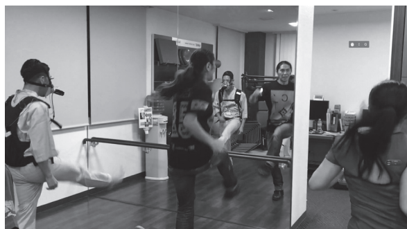
Fig 1: Dance instruction.

While undergoing dance exercise in a group, all patients wore an activity monitor (Active style Pro HJA-750C, OMRON, Kyoto, Japan) at their hips to record metabolic equivalents (METs) every 10 seconds. One metabolic equivalent (MET) is defined as the amount of oxygen consumed while sitting at rest and is equal to 3.5 \text{ mL O}_2 per kg body weight \times min.